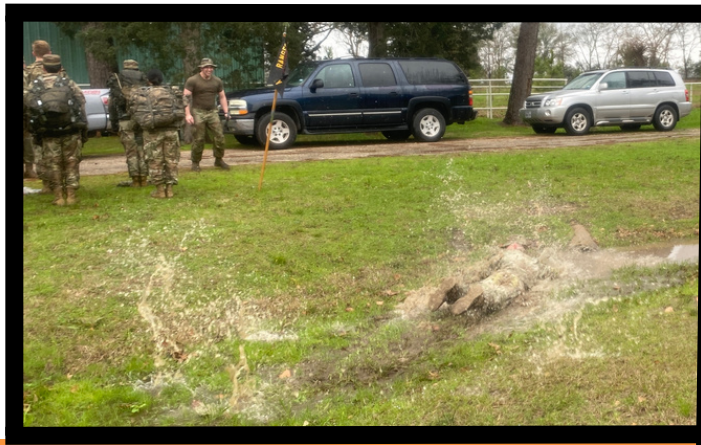
Ranger Company Scrolls leading by example