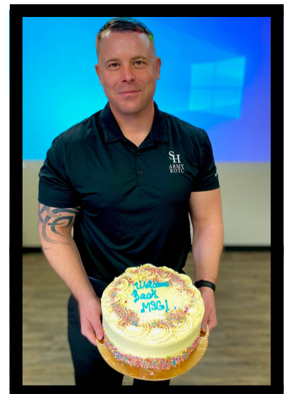
MSG Liberatore MS1 class welcomed him back with a cake