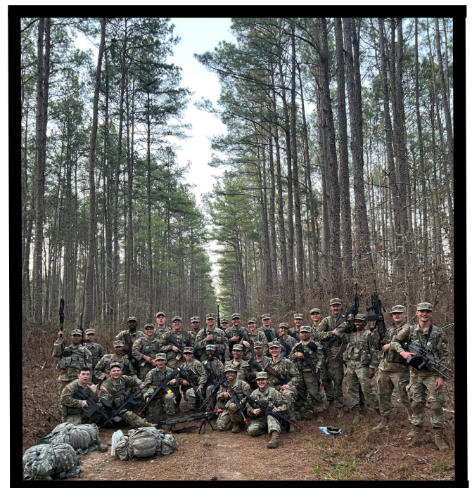
Cadets during last year's MPFTX at Stephen F. Austin State University