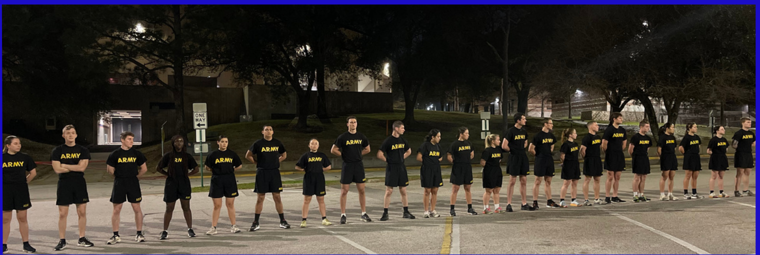
Cadets being recognized for their outstanding GPA during Fall semester

February was an exciting time for the program, the seniors were preparing for their future roles in the Army, the Sophomores were learning what it takes to be a Junior in ROTC, and the Freshmen were experiencing the events that makes Sam Houston ROTC Cadets the future of the Army. With Cadets volunteering their time in the community and participating in extracurricular activities, February has been a busy month for the program. Let's keep up the energy and make March equally as exciting!