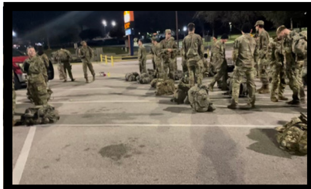
Cadets preparing for the ruck