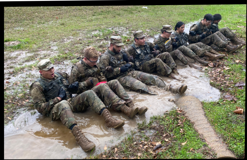
Ranger Company cadets building team camaraderie