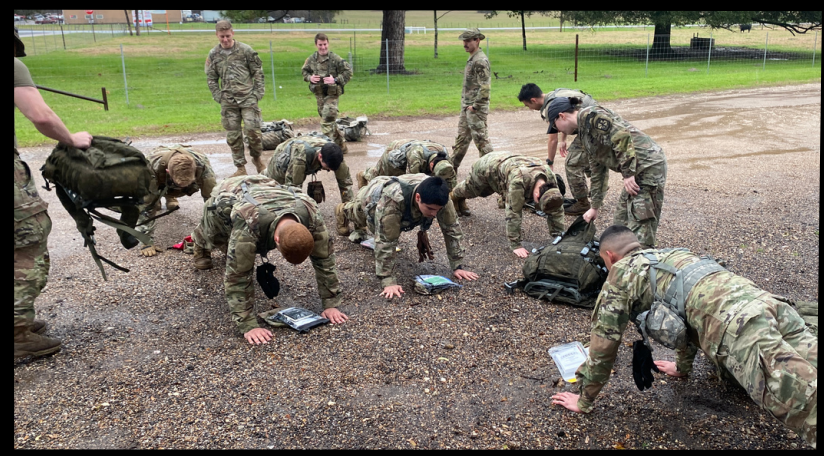
Cadets at Day Zero formation